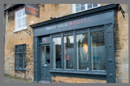
Trinity House Modern