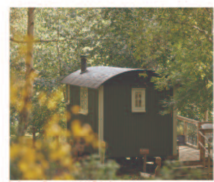
Leisure - Famcombe Estate

Conservation - National Trust - Knightshayes