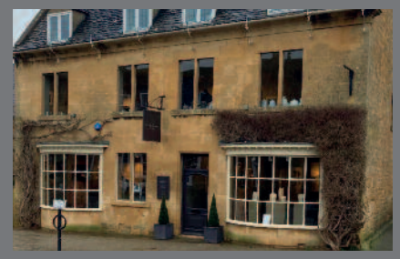
The Stratford Gallery