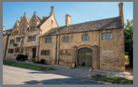
Broadway Museum & Art Gallery