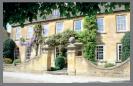
Haynes Fine Art