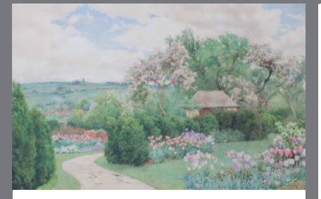
Throughout the Festival 10.30am-4pm, Tuesday to Sunday