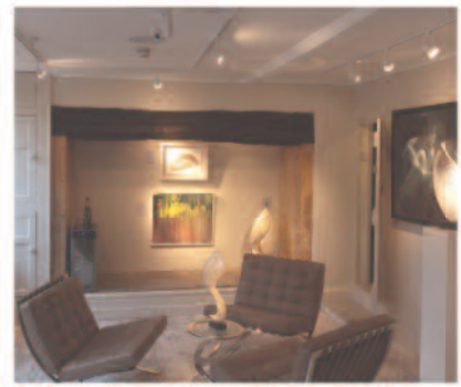
Commercial - Trinity House Paintings, Broadway

Architects in Broadway Proudly Supporting Broadway Arts Festival